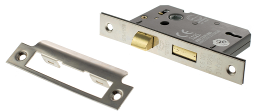
Product Finish Pictured: Polished Nickel (PN)